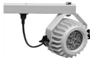
Heavy Duty Head